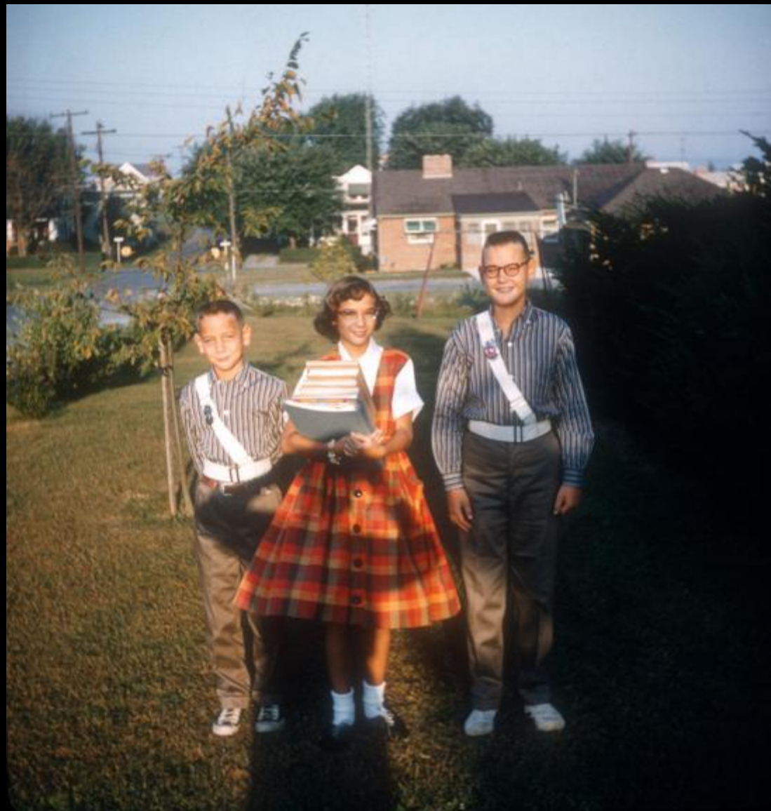
1959-LLF004 Ready for 1st day of school Sept 1959