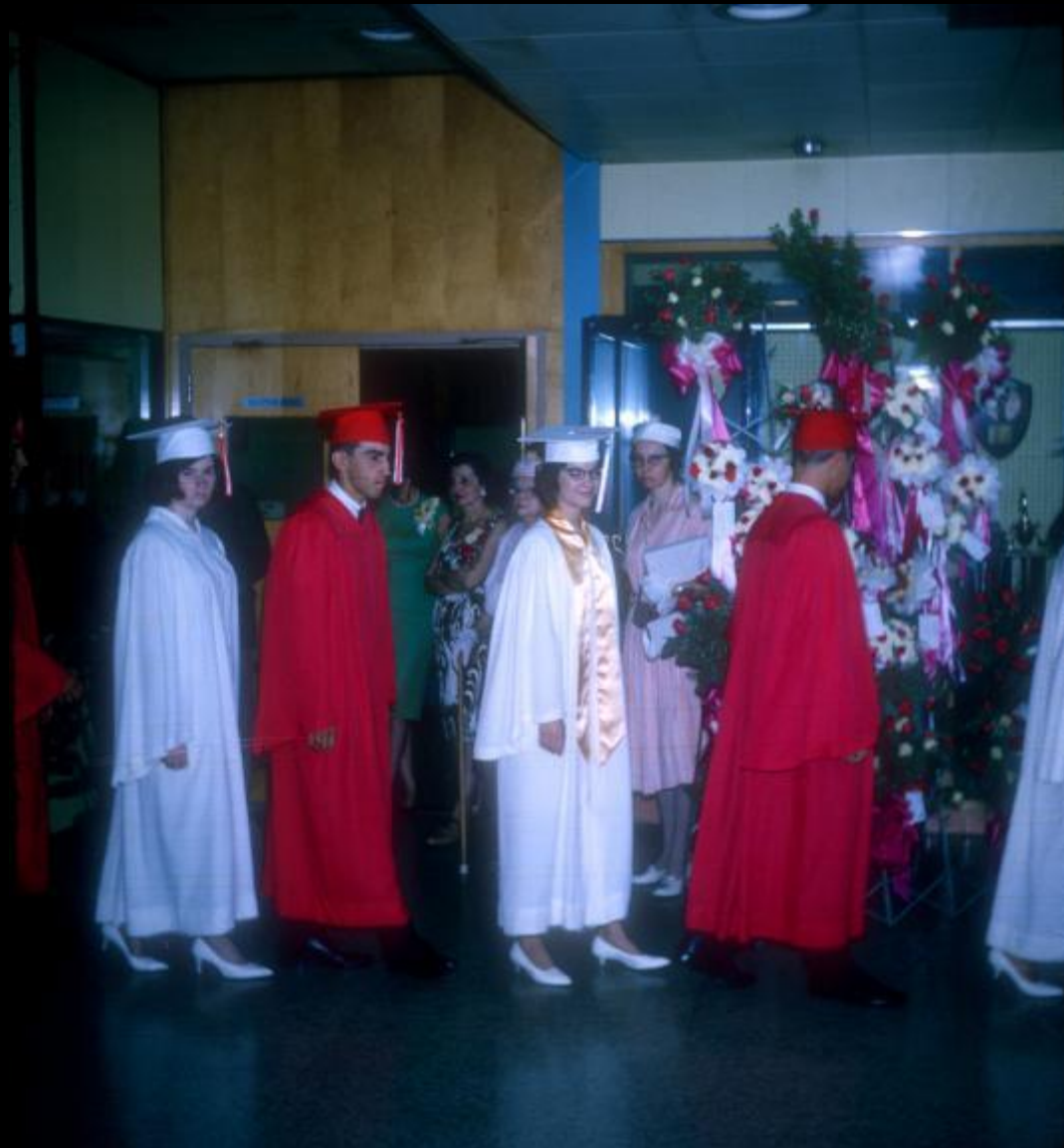
1965-LDB020 - Linda HS graduation- yellow band denotes National Honor Society - #7 in class of 525