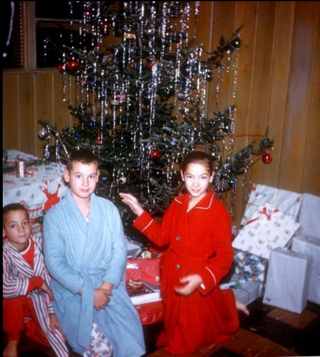
1958-LLF005 Christmas 1958 at Maugansville