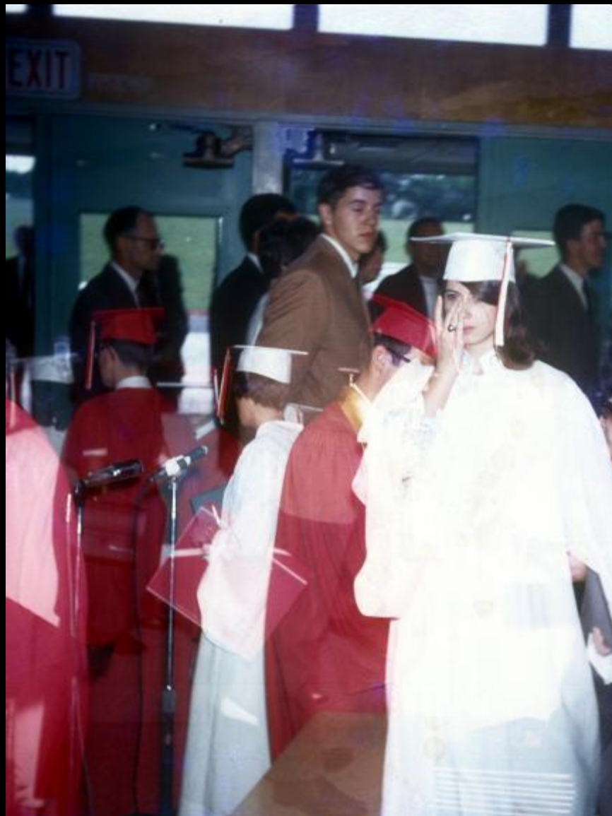
1965-LDB038 Someone is teary-eyed about graduating, but WHO no slide date