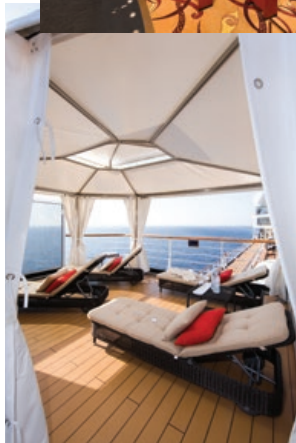
SHIP'S REGISTRY: THE NETHERLANDS